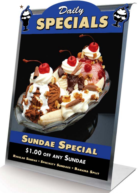
SIZE: 9 1/2" W x 12 1/2" H x 4" D WEIGHT: 5 Lbs.